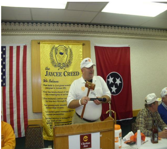
Oh Wise One!