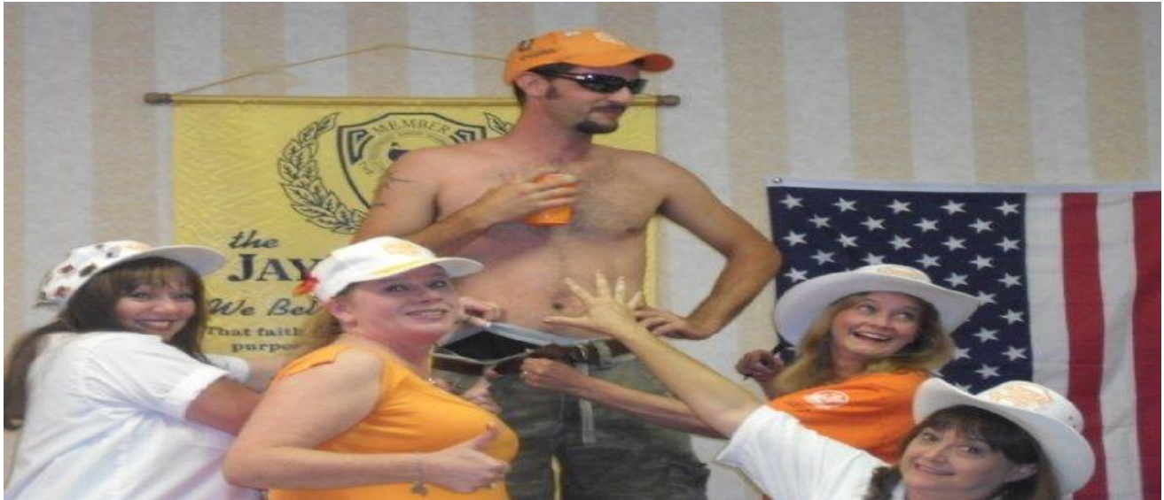
Ladies, I hear the Boy Toy is coming to Gatlinburg!