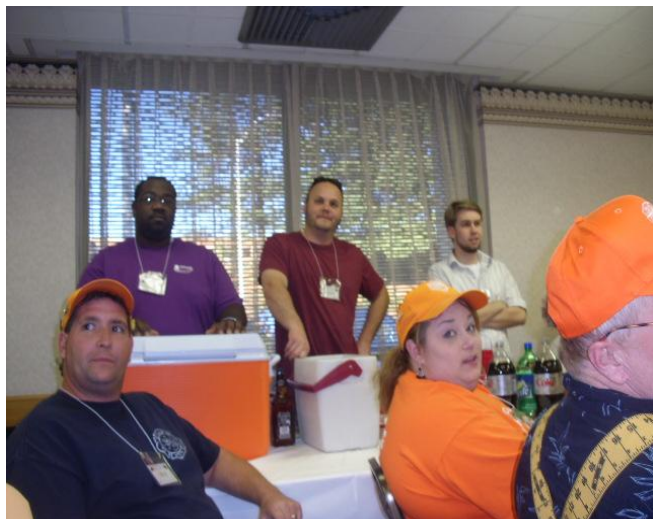
Bartender Pour Me Another!