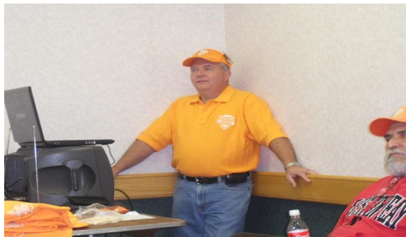
Products GURU hard at work!