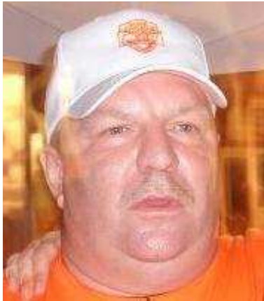
OUR Supreme Commander! The One, The Only.... The Original!

We're on the Web! www.tnjcvolunteercorps.com